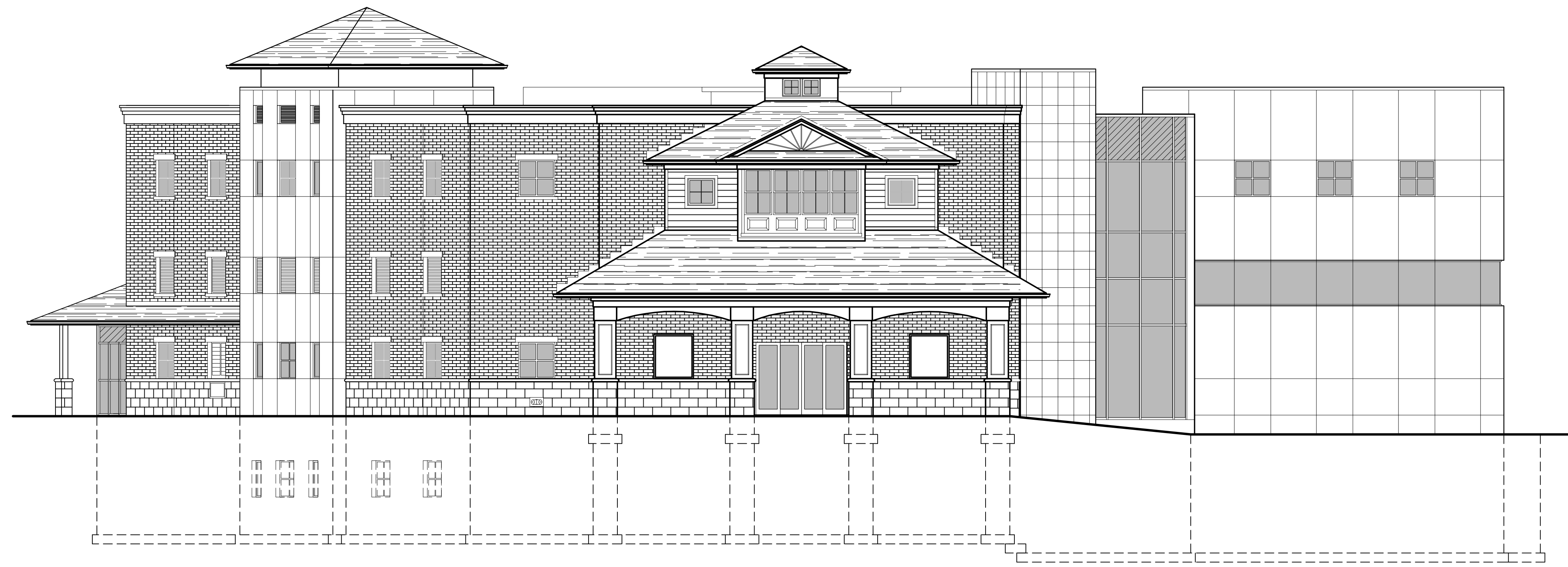
① EAST ELEVATION SCALE 1/8" = 1'-0"