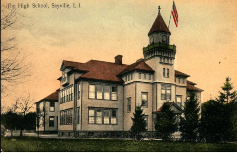
The High School, Sayville, L. I.

The mission of our special collection is to preserve items of significance to our unique location on Long Island. We look for records, photographs or memorabilia that help us reconstruct the past and foster an accurate description of what life was like for our predecessors.